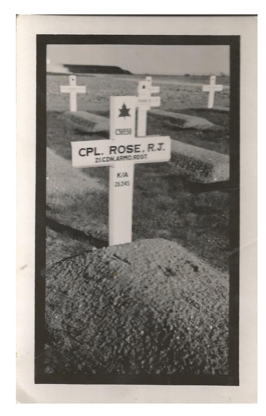
Initially simple crosses marked the graves in early years at Groesbeek war cemetery.

His remains were re-interred in 1946 in the Groesbeek Canadian War Cemetery near Nijmegen, the Netherlands. His burial reference is grave XII. C. 24.